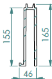
Modula cross-section detail

Scan for access to technical documents library